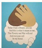
MLK Day poster