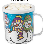
Plastic mug with DIY insert