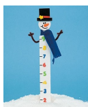
Snowman ruler to measure snowfall