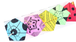
Spinning Top Toy