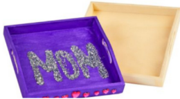
Wooden Catchall Tray