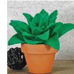
Mini Felt Planter