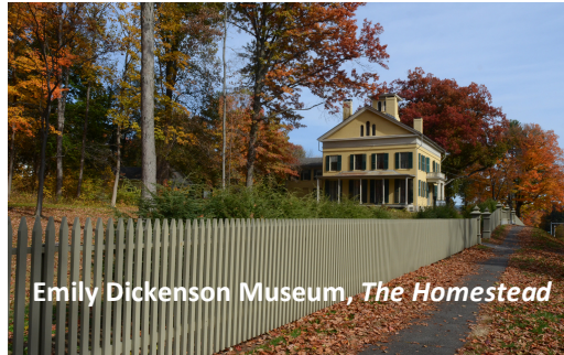
Emily Dickinson Museum, The Homestead

The maple wears a gayer scarf, The field a scarlet gown. Lest I should be old-fashioned, I'll put a trinket on.