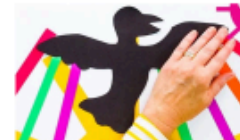
Blackbird with ribbon Craft