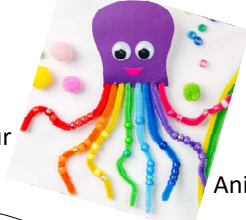
Animals of the Sea: Octopus, Jellyfish, Oyster, Starfish

August's Challenge is a scavenger hunt with the clues being the silhouette's of our most popular storybook characters.