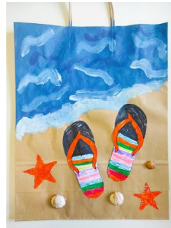
Paper Bag Artistry