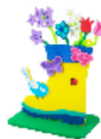
April showers bringing spring flowers