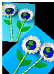
Remember Earth Day!