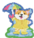
Rainy Day Pups