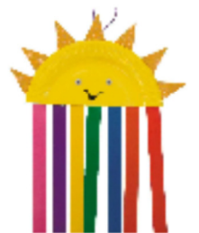
A Wind Catcher Craft

Back by popular demand— a real kite to decorate and fly.