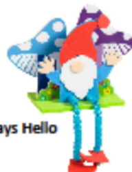
A Gnome says Hello